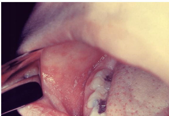
Figure 1. Koplik spots on the buccal mucosa