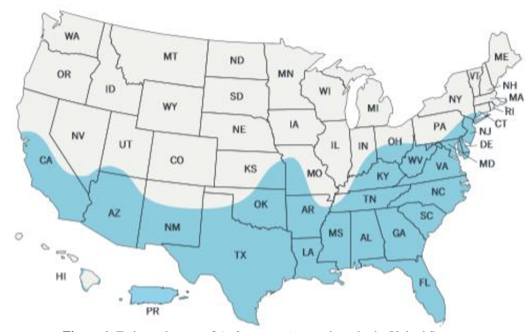
Figure 1. Estimated range of Aedes aegpyti mosquitoes in the United States.

Zika virus is mainly transmitted through bites from infected mosquitoes. Aedes aegypti and Aedes albopictus are known vectors of Zika. Figures 1 and 2 below show CDC's best estimate of the potential range of Aedes aegypti and Aedes albopictus in the United States, respectively. It does not, however, show the exact locations or numbers of mosquitoes living in an area; nor does it show the risk or likelihood that these mosquitoes will spread viruses. Figure 3 shows the known distribution of Aedes albopictus in West Virginia; Aedes aegypti has not been identified to date.